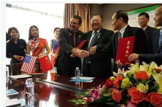
OCC signed a Memo of Understanding with the China General Chamber of Commerce in Fujian Province regarding the development of a modern agricultural complex in Fujian.